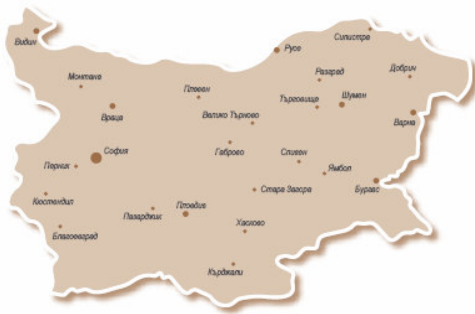
Allocation and number of the private enforcement agents /163/ on the territory of the Republic of Bulgaria at judicial areas of activity's